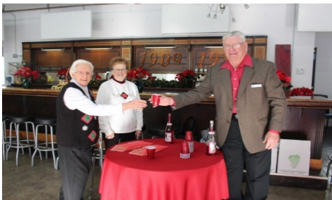
More photos of this great event may be found on Atwater Area Help for Seniors Facebook page.